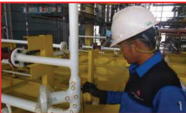
Ultrasonic (UTTM) Testing on pipe Asia Propel-PKFZ Selangor