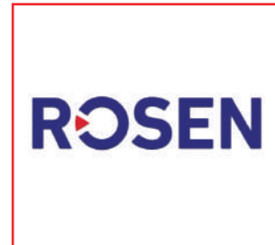
H. ROSEN Engineering Sdn Bhd