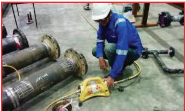
Radiography Testing on Flanges, KQKS Meru, Selangor