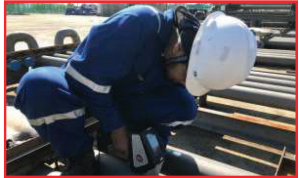
Positive Material Identification by LIBS (PMI) on pipe at Petronas Chemical Group Berhad, Kerteh Terengganu