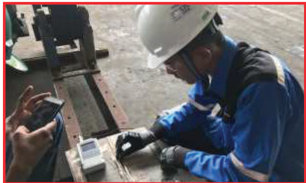
Ferritescope Test (FT) on Duplex material plate at PMI Technologies Sdn Bhd, Shah Alam Selangor