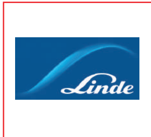
Linde Malaysia Sdn Bhd