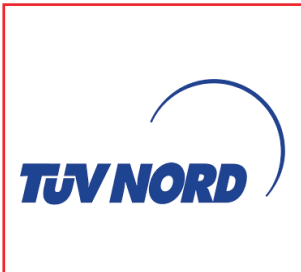
TUV Nord (M) Sdn. Bhd