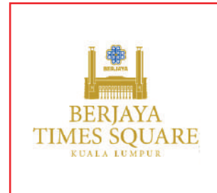
Berjaya Times Square Sdn Bhd