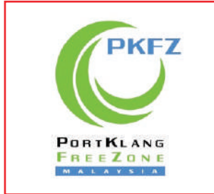
Port Klang Free Zone (Aker Solutions)