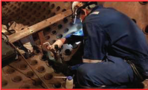
Metallography testing by Replica (RM) on superheater tubes of boiler at FGV Holding Berhad, Kuantan Pahang