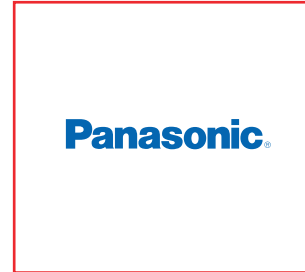
Panasonic (M) Sdn Bhd