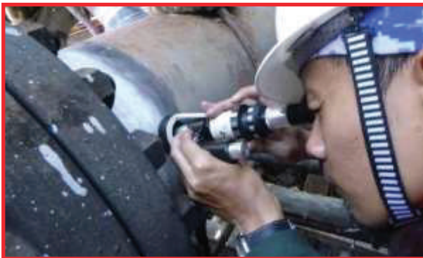
Metallography by Replication Testing on Pipe/Tube, Rapid Pengerang, Petronas.